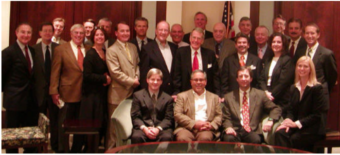
photo of the PPC and Board Members at a recent joint meeting

legal needs for the indigent and underserved in our community. There are plans for a scholarship fund to promote law-related educational opportunities, and we have discussed the goal of bringing nationally known speakers to Virginia Beach. Our hope is that these speakers can assist in educating members of the public about the importance of law in their daily lives and in enhancing the image of the legal profession in Virginia Beach.