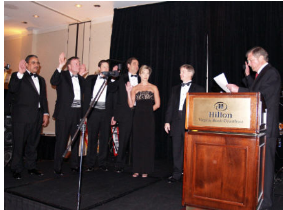
2009 Board of Directors