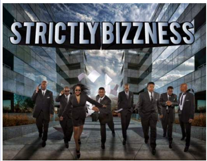
Cavalier Golf & Yacht Club 1052 Cardinal Road, Virginia Beach, VA 23451