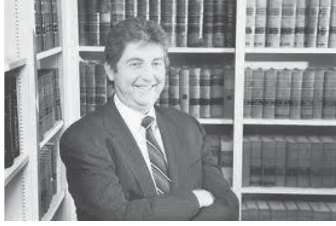
August 20, 1954-July 21, 2011

The Virginia Beach Bar Association would like to offer our sincere condolences to two members of our extended family.