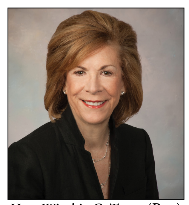
Hon. Winship C. Tower (Ret.) Retired Judge, Virginia Beach

Retired Judge, Virginia Beach Juvenile and Domestic Relations Court