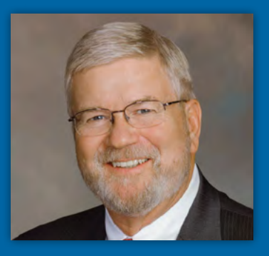
Hon. F. Bradford Stillman Former Magistrate Judge, U.S. District Court, Eastern District of Virginia