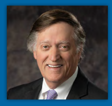
Hon. Westbrook J. Parker Former Chief Judge, Suffolk Circuit Court